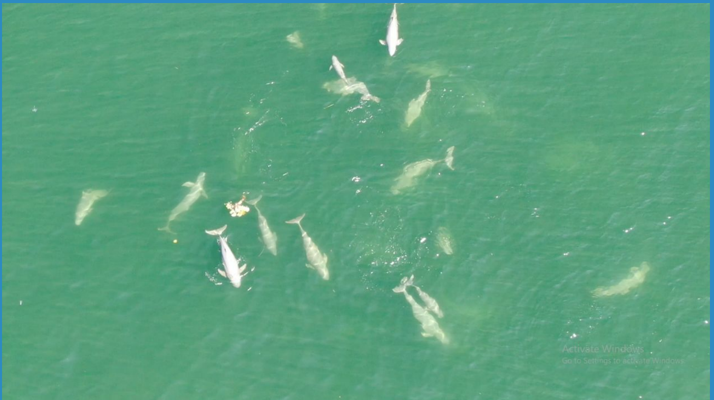
Figure 1: Irrawaddy dolphins in Cambodia's Kep Archipelago, within the Kien Giang and Kep Archipelago IMMA.

Information on the cetaceans in Kien Giang and the Kep Archipelago is accumulating through ongoing study efforts in both Vietnam and Cambodia. On the Vietnamese side, three opportunistic surveys took place to investigate cetacean status in KGBR from 2011 to 2013. A total of four sightings of Irrawaddy dolphins ( Orcaella brevirostris ) were made during a 4 weeks survey period (Vu et al., unpublished data). Following this, a systematic boat-based survey using line-transects and photo-ID was conducted in 2014