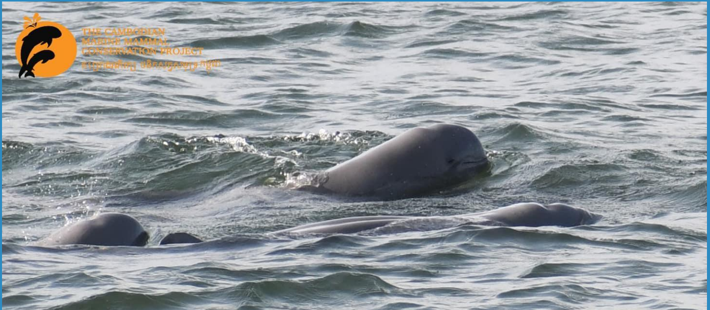
Figure 2: Irrawaddy dolphins in Cambodia's Kep Archipelago, within the Kien Giang and Kep Archipelago IMMA.

and 2015 to access distribution and abundance of cetaceans in KGBR (Vu et al., 2014, 2015, 2017). Three cetacean species, including the Irrawaddy dolphin, Indo-Pacific finless porpoise ( Neophocaena phocaenoides ) and Indo-Pacific humpback dolphin ( Sousa chinensis ) were recorded. Average encounter rates of O. brevirostris , N. phocaenoides and S. chinensis were 2.56, 0.27 and 0.4 individuals per 100km of on-effort tracklines, respectively. The preliminary Photo ID/Mark-recapture analysis performed on 536 pooled photos of Irrawaddy dolphin dorsal fins acquired in KGBR from 2012 to 2014 estimated 72 individuals (CV=35%) in this area (Vu et al., 2015). Additional to those data, opportunistic sightings of False killer whale ( Pseudorca crassidens ) (n=1) and Bryde's whale ( Balaenoptera edeni ) (n=1), a stranding case of a Pantropical spotted dolphin ( Stenella attenuata ) (n=1) and bycatch of Indo-Pacific bottlenose dolphin ( Tursiops aduncus ) (n=2) were recorded from local media in KGBR (Vu et al. unpublished data). As for the Cambodian side, the Irrawaddy dolphin is the only marine mammal species with confirmed presence in the waters of the Kep Archipelago (Tubbs et al., 2019; 2020).