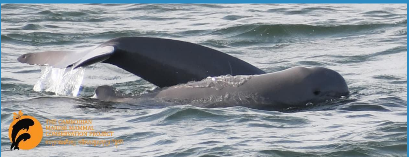
Figure 3: Irrawaddy dolphins in Cambodia's Kep Archipelago, within the Kien Giang and Kep Archipelago IMMA.